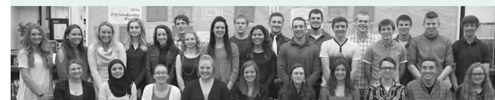
Valley Forge High School