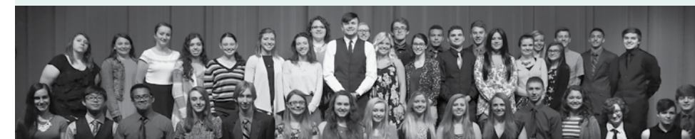
Parma Senior High School

On Friday, April 29, the annual "Winners Circle" scholarship presentation ceremony was held throughout the Parma City School District. 105 seniors from Normandy, Parma and Valley Forge High Schools were presented with scholarships from a variety of sponsors, and the entire day was organized by the Parma Council of PTAs. In total, just under $100,000 was awarded to high school seniors. The PTA Geranium Sale, the 64th annual, was one of the Council's major fundraisers for scholarships for students.